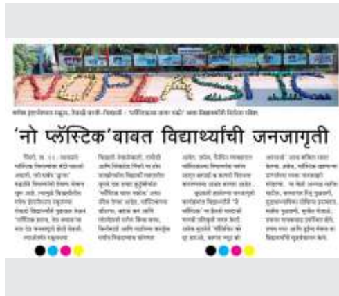
NO PLASTIC DAY