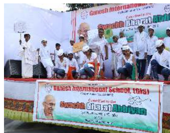
SWACHH BHARAT ABHIYAN