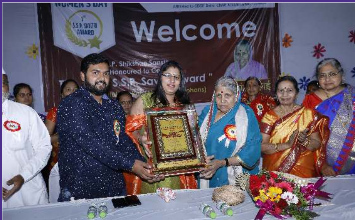
S.S.P. Savitri Award for the year 2018-2019 on Women's Day Celebration