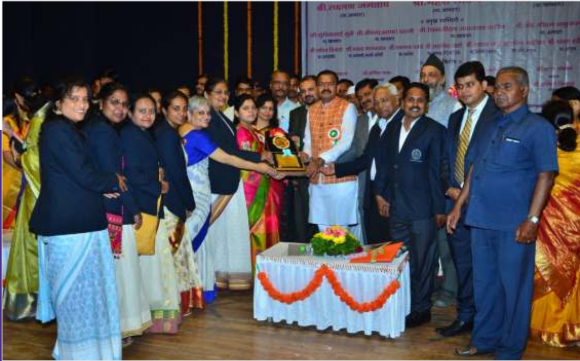
Ganesh International School was awarded "PCMC Best School Award 2018"