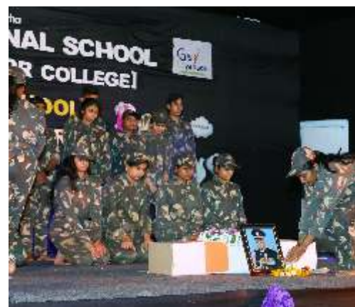
TRIBUTE TO CDS BIPIN RAWAT