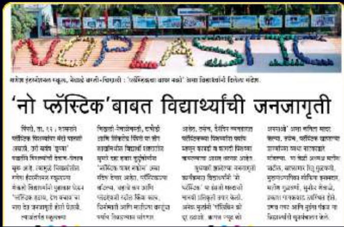
Drive against use of plastic